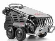
CI H20 EM INOX