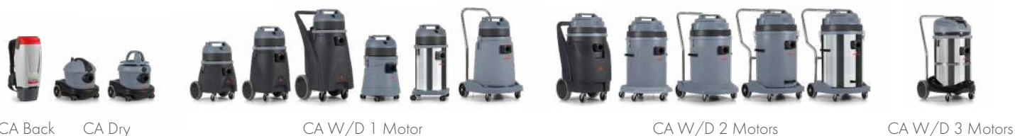
CA Back CA Dry

Professional vacuum cleaners that are easy to handle and robust, offering excellent versatility to meet a diverse range of needs and applications: from cleaning of environments to vacuuming solid and liquid residues.