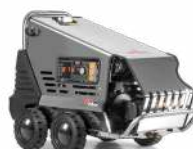
CI H40 EM INOX