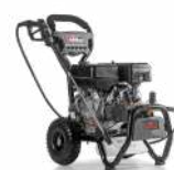
CI C40 EM THERMIC