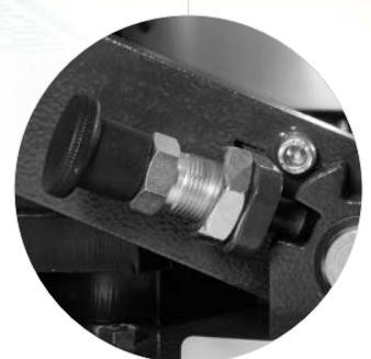
Quick release of the motor brush head from the chassis and of the 17kg weight. Quick disconnection of electrical system