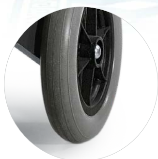
Large rubber wheels for easy transport